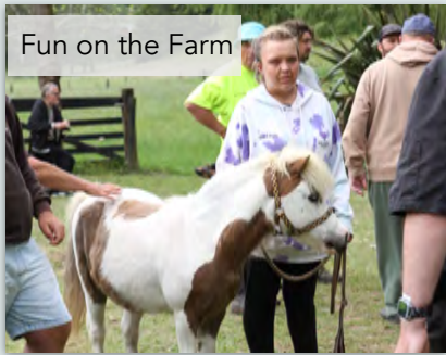
Fun on the Farm