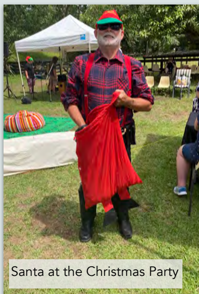
Santa at the Christmas Party