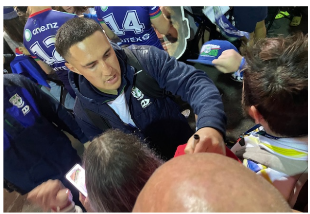
UP THE WAH'S UP THE WAH'S UP THE WAH'S