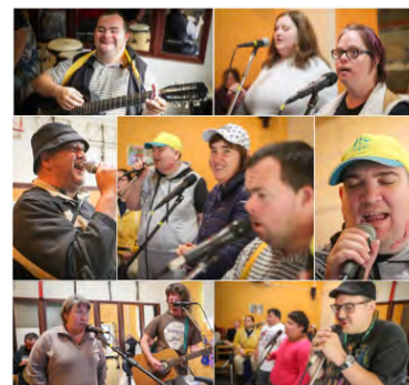
THE LIFE STYLE SINGERS 2019

The new CD is out now. A great collection of covers and some original tracks